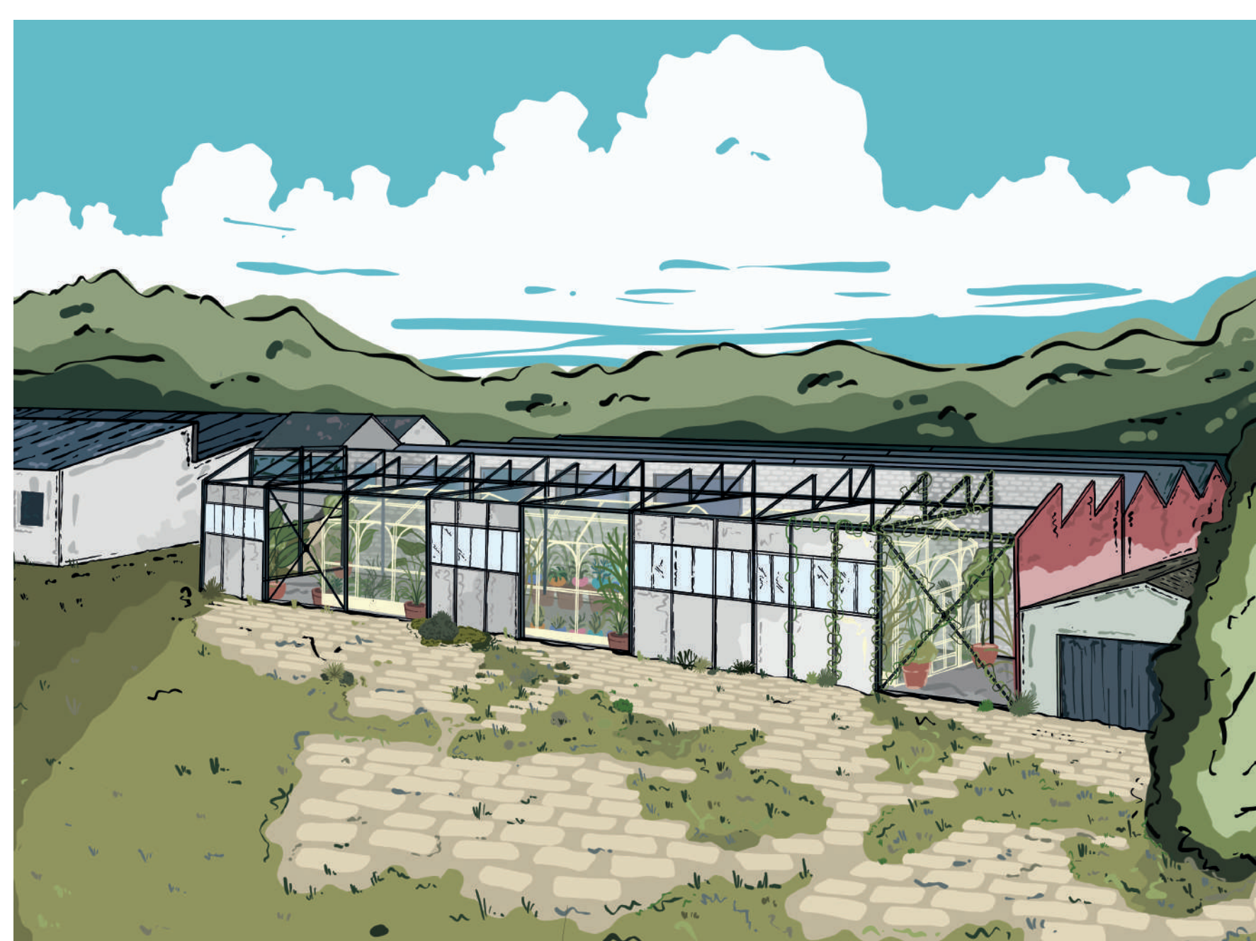
Ambient view of the greenhouse