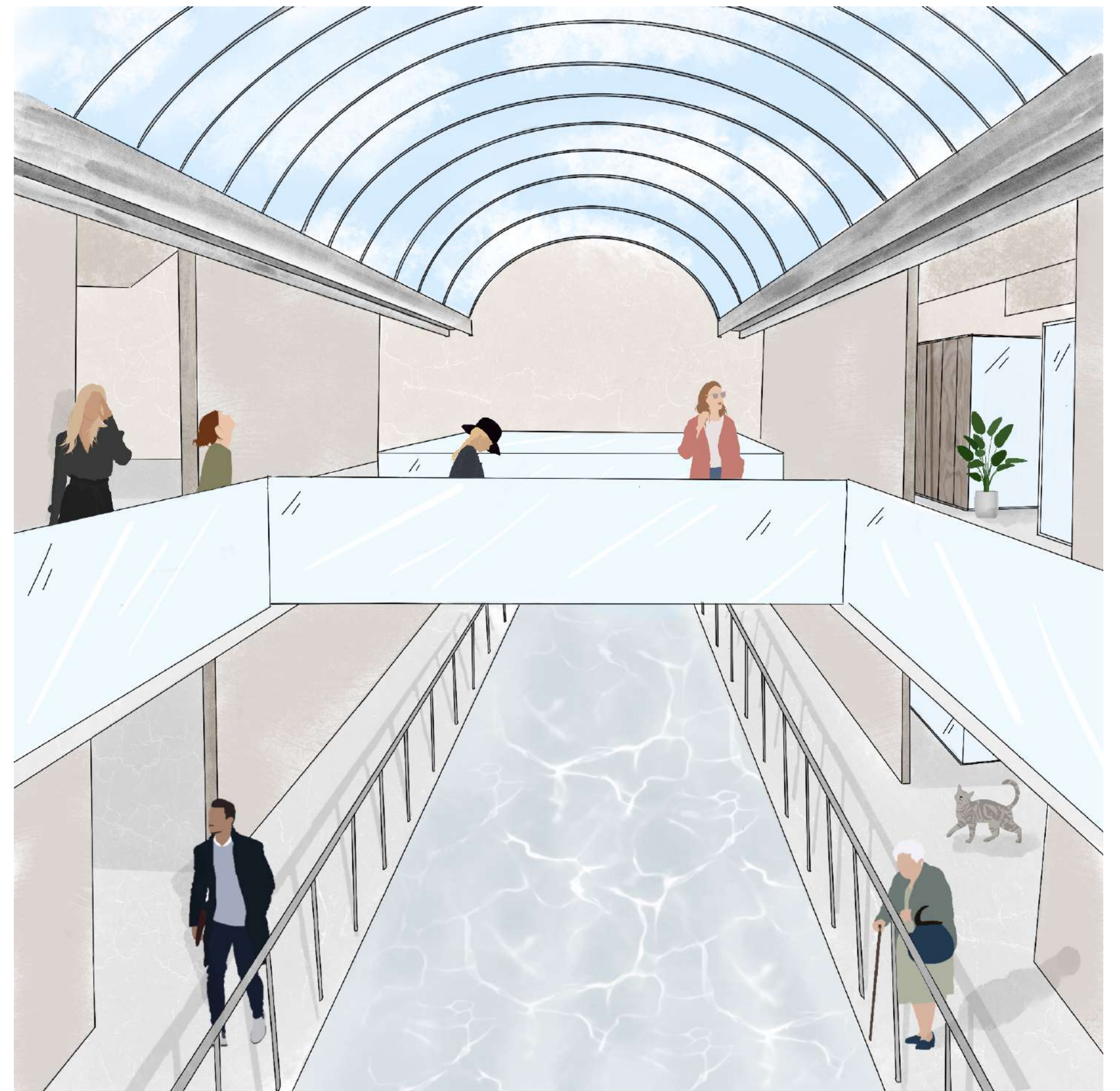
Perspective of the double-height building above the inner canal