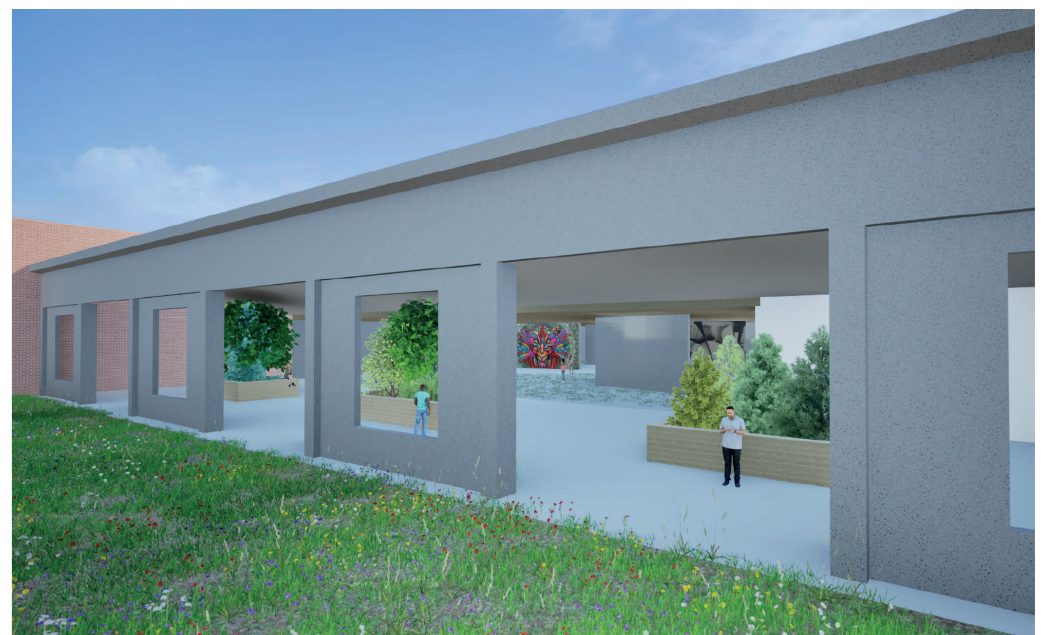
View of the covered gardens