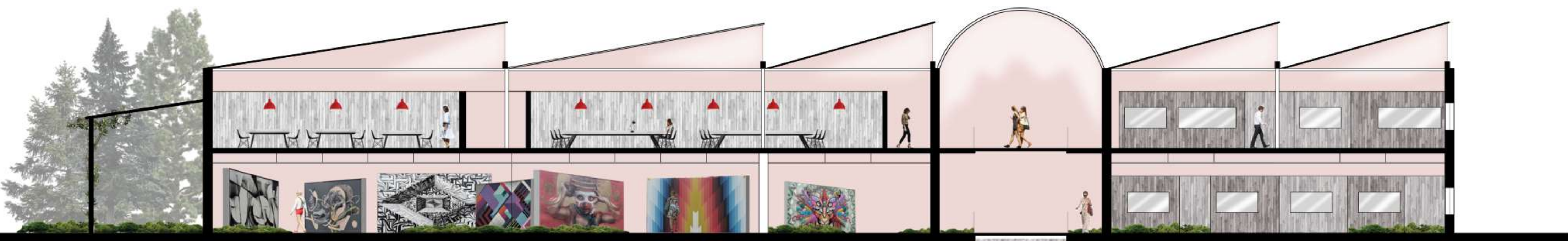
Cross section B-B