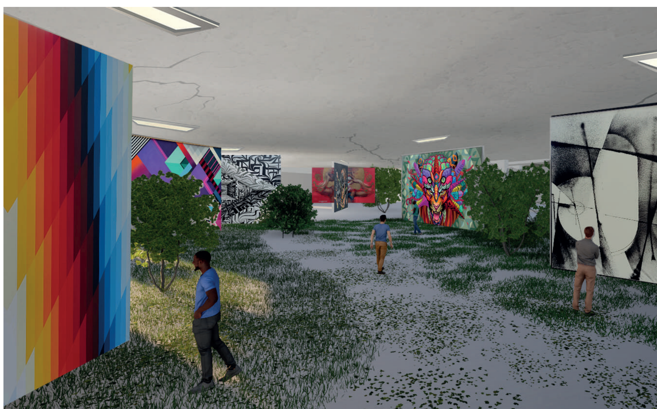
Ambient view of the exhibition hall